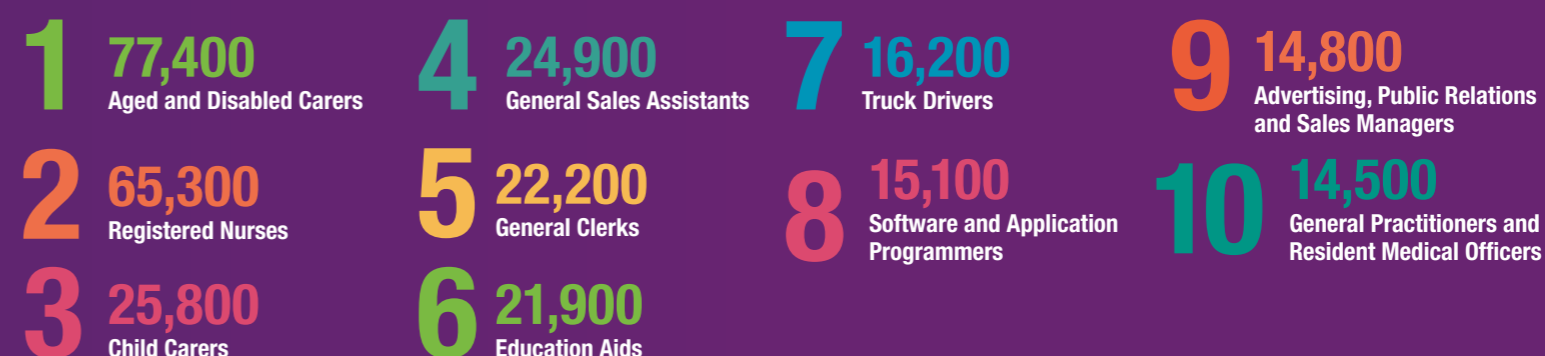
The 10 occupations projected to add the largest numbers of new jobs over the 5 years to May 2022 are:

Technology and the automation of work has resulted in an increase in the share of people employed in jobs that involve non-routine tasks which are difficult to automate or require a human presence (such as Aged and Disabled Carers, Chefs, Teachers, Plumbers, and Software and Application Programmers ).